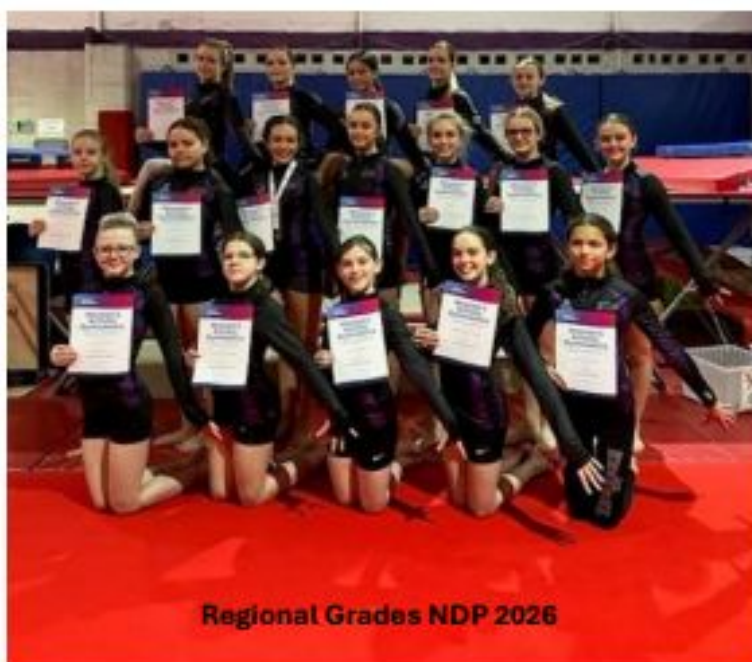
Regional Grades NDP 2026